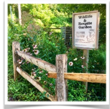
The wildlife garden at Penn Valley's West Mill Creek Dog Park will join the Pollinator Pathway

Homeowners, business owners, park stewards, and public institutions are encouraged to incorporate native plants into their landscapes to provide valuable food for insects and birds. Pathway properties will also avoid using chemicals in the landscape—mosquito sprays, synthetic fertilizers, and pesticides—to provide safe habitat for visiting pollinators and will leave some plant stems and leaves on the ground for winter habitat. Stewardship also includes removing invasive species that crowd out native plants and provide little year-round value to wildlife. See our website for more ideas.