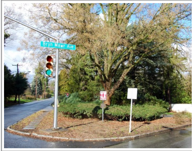
Penn Valley's largest traffic island at Bryn Mawr and Old Gulph Road before renovation.