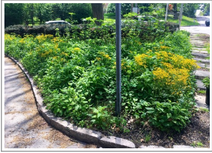
The island after new native plantings. Spring blooming Golden ragwort ( Packera aurea ) brightens the space and provides services to pollinators.

space. If you would like to have some of the native blue wood asters ( Symphotrichum cordifolium ) that we are removing, please email us at pennvalleycivic@gmail.com .