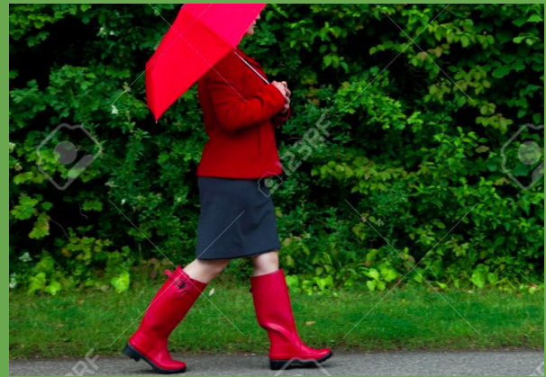
Notice that this hedge pruning/growing approach allows a safe landing for walkers

This child has no safe way of jumping out of the way of traffic because hedges grow directly to the road's edge.