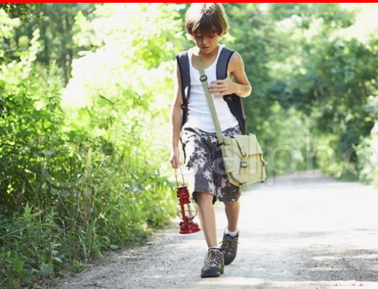
Poor hedge management with no safe landing for pedestrians

This child has no safe way of jumping out of the way of traffic because hedges grow directly to the road's edge.